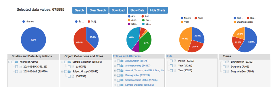
Fig. 2. HADatAc's faceted search for values with pie chart displays of distributions.

search, as shown in Figure 2, and finally (6) download of datasets generated from the current selection of a search in the data faceted search tool. We have used a combination of techniques to identify and retrieve variables to be used in the demo, mainly the NHANES Variable Search<sup>8</sup> and, to generate datasets for ingestion into HADatAc, the RNHANES R package<sup>9</sup>, which allows extraction of select named variables across NHANES datasets. Our claim is that HADatAc can play the roles of those multiple techniques for variable identification, retrieval, and dataset generation for diverse domains.